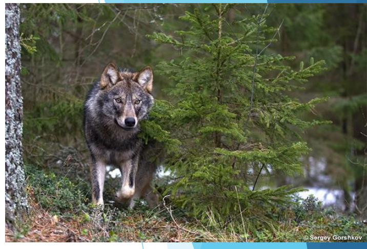
Picture URL: https://external-content.duckduckgo.com/iu/?u=http%3A%2F%2Fwildlifeact.com%2Fwp-content%2Fuploads%2F2013%2F06%2FSlovenia-Wolf.jpg&f=1&nofb=1